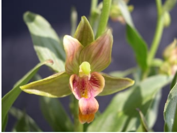
Epipactis gigantea Society Adopted Orchid

Lompoc, California www.coastalvalleyorchidsociety.com