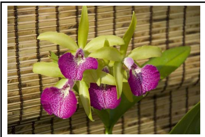
Blc. Memoria Vida Lee

"The purposes of the Coastal Valley Orchid Society are to promote and stimulate interest in orchids; to encourage the culture and conservation of all orchids; and to provide for the exchange and dissemination of information relating to the culture of orchids among members of the Society."