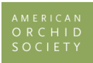
An AOS Affiliate Society Since 2002