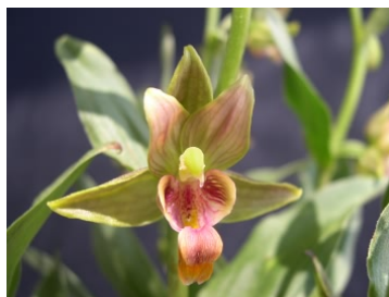
Epipactis gigantea Society Adopted Orchid