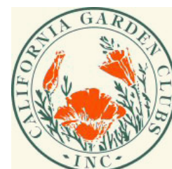
Member Since 2010