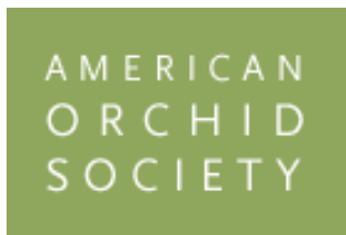
An AOS Affiliate Society Since 2002

Calendar of Events / Other Society Meetings 4